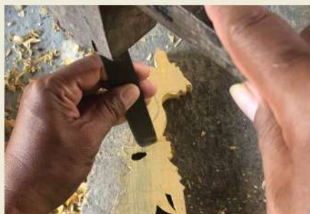
STEP 1 : MAKING PATTERN