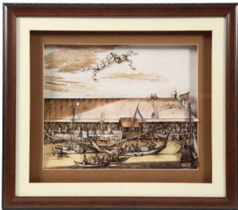
F15-Fish Market : 505 x 500 x 70 mm