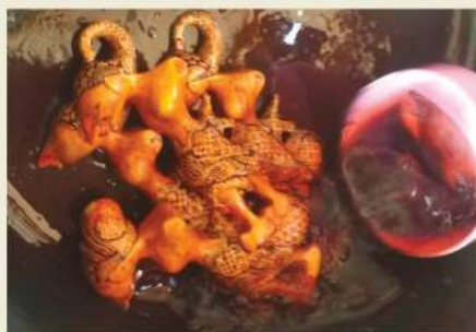
STEP 5 : COLORING