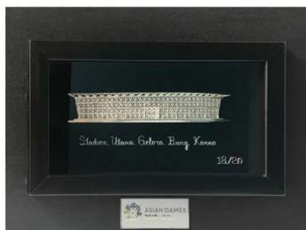
GELORA BUNG KARNO MAIN STADIUM