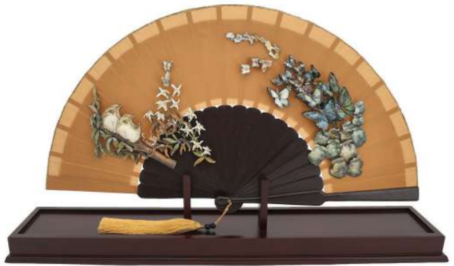
Kipas : 640 x 380 x 110 mm