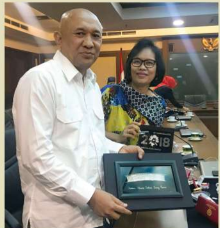
Internal meeting discussion the products of UMKM with Mr. Drs. Teten Masduki, Minister of Cooperatives and SMEs and team, December 2019.