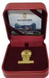
3D PIN - IKN