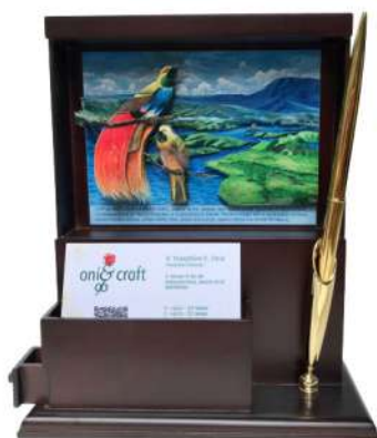
S10 : 200 x 170 x 80 mm