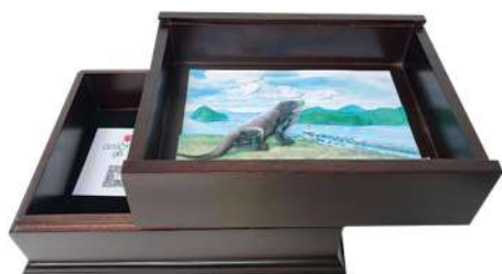
S11 : 175 x 135 x 75 mm