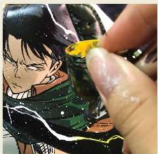
STEP 7: AIR BRUSHING