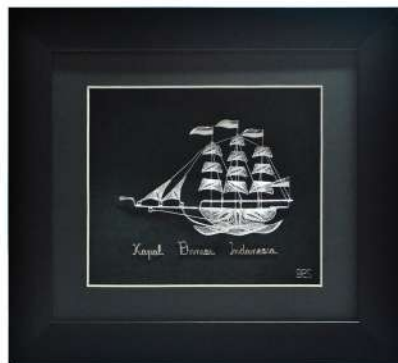
INDONESIA PHINISI SHIP