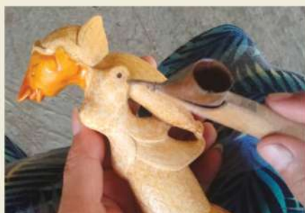
STEP 4 : BATIK MOTIF DRAWING