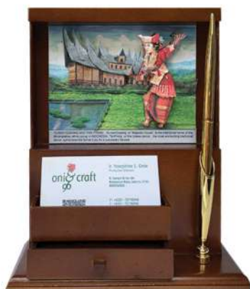
S9 : 200 x 170 x 80 mm