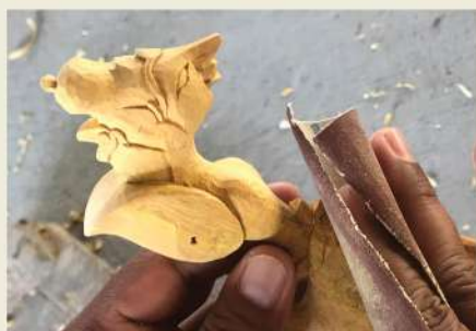
STEP 3 : SANDING