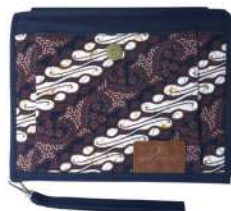
DIARY / NOTEBOOK