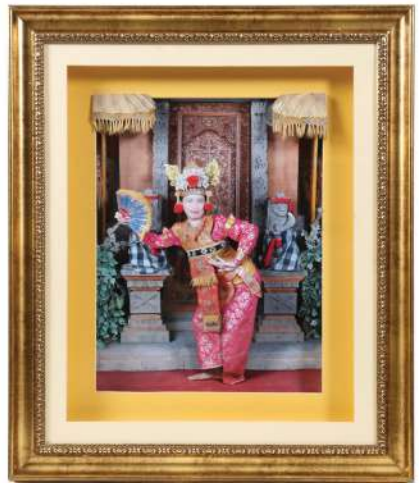
Custom Balinese Dance : 600 x 530 x 80 mm