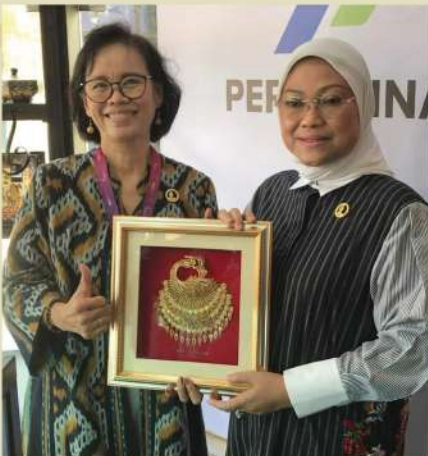
Mrs. Dr. Hj. Ida Fauziyah, M.Si. is currently the Minister of Manpower of Indonesia, visited our booth at the G20 Summit Meeting in Bali Indonesia, last November 2022.