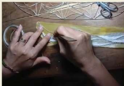
STEP 2 : MAKING PATTERN