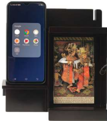
S12 : 225 x 215 x 75 mm