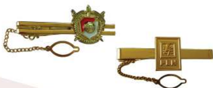
3D TIE CLIP