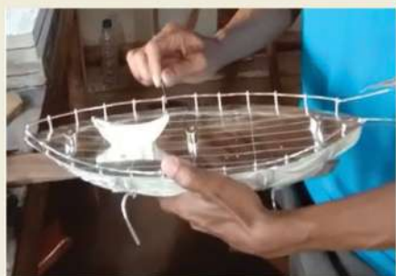
STEP 5 : MODEL FORMATION