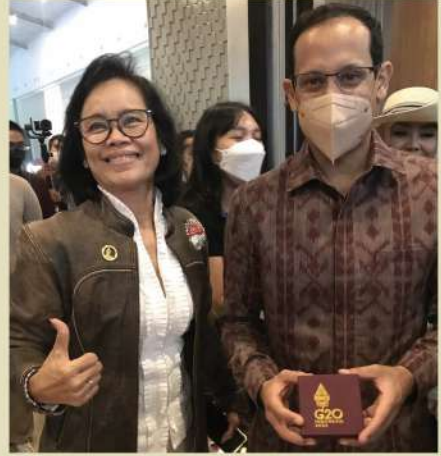
Mr. Nadiem A. Makarim, B.A., M.B.A. is the 29th (current) Minister of Education, Culture, Research and Technology of Indonesia, visited our booth at the TradExpo Indonesia event in October 2022.