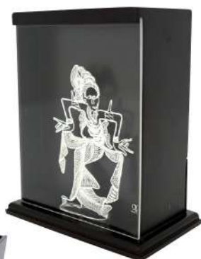
S3 : 150 x 130 x 80 mm