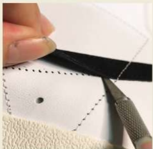
STEP 1: CUTTING