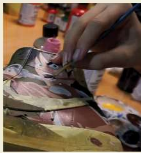
STEP 6: HAND PAINTING