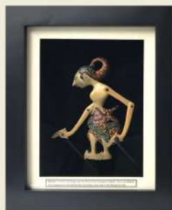
STEP 6 : FINISHED PRODUCT