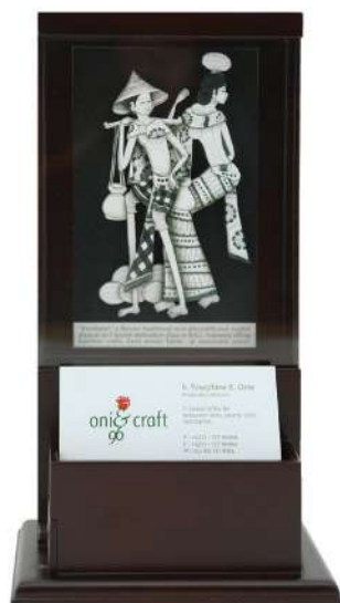
S6 : 235 x 130 x 80 mm