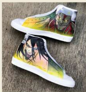
STEP 9: FINISHED INNER SIDE