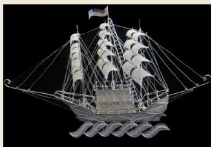
STEP 6 : FINISHED PRODUCT (SHIP)