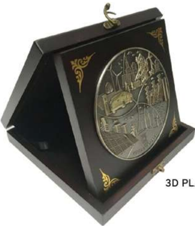
3D PLAQUE - PLN