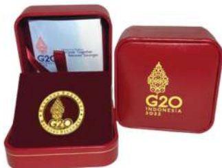
3D PIN G20