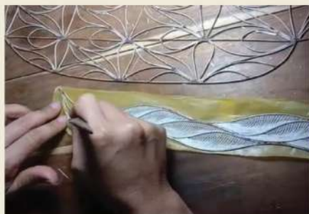
STEP 4 : PATTERN FILLING