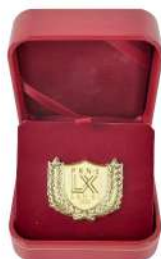
3D PIN LAN PKN