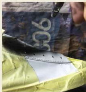
STEP 3: AIR BRUSHING