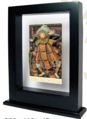
F3 : 200 x 160 x 47 mm