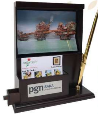
S10 - Custom : 200 x 170 x 80 mm