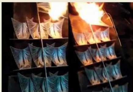
STEP 3 : BRAZING