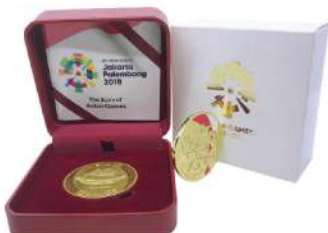
3D COIN ASIAN GAMES