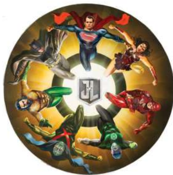
JUSTICE LEAGUE IN ACTION