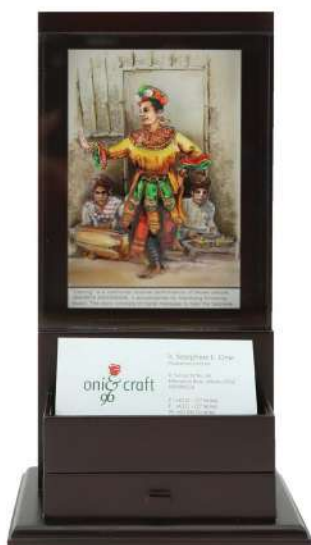
S5 : 235 x 130 x 80 mm