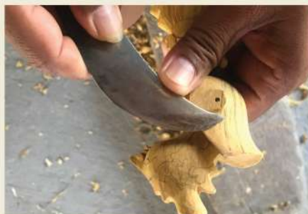
STEP 2 : CARVING