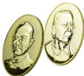
3D COIN FACE PHOTO