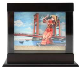
S13 : 170 x 150 x 85 mm