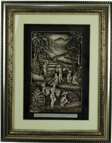
F15-Rice Field : 540 x 430 x 130 mm