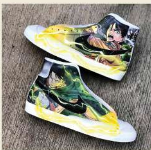
STEP 8: FINISHED OUTER SIDE