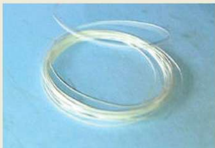
STEP 1 : SILVER 925 THREAD