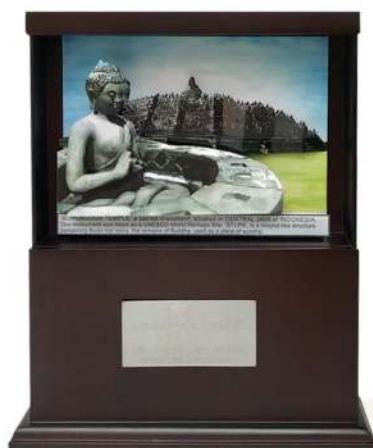
S8 : 200 x 170 x 45 mm