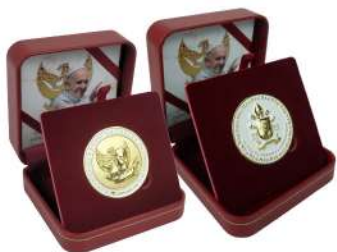
3D COIN POPE FRANCIS