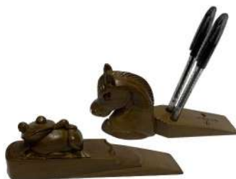
WOOD : DOOR STOPPER/PEN HOLDER