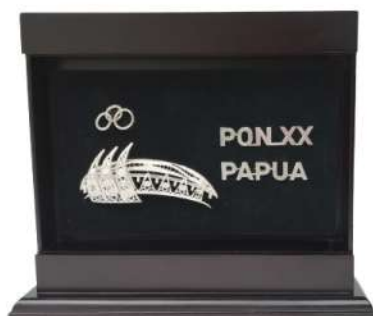
S13 - CUSTOM : 170 x 150 x 85 mm