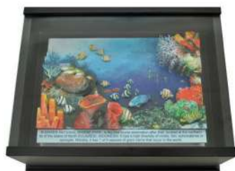
S2 : 175 x 135 x 75 mm