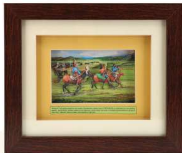
F1 : 260 x 220 x 40 mm