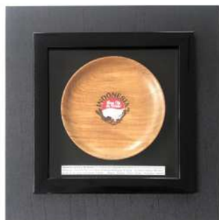
FR. SPICE UP THE WORLD