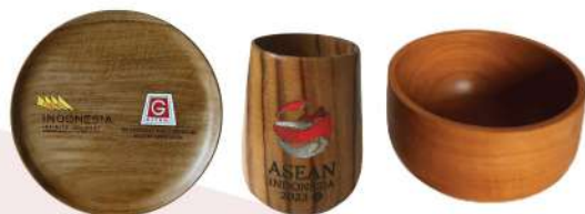
WOOD : PLATE, CUP & BOWL