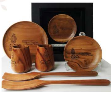
WOOD : CUTLERY SET