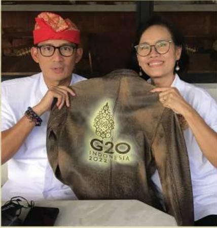
Mr. H. Sandiaga Salahuddin Uno, B.B.A., M.B.A. is the 13th (currently) the Minister of Tourism and Creative Economy, visited our booth at the G20 Summit Meeting in Bali-Indonesia last November 2022.