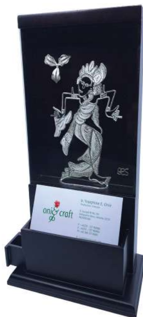
S6 : 235 x 130 x 80 mm