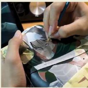
STEP 5: HAND PAINTING