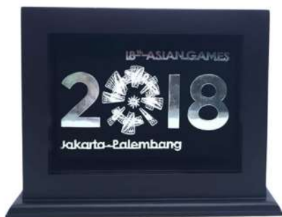
F14 - CUSTOM : 190 x 155 x 85 mm