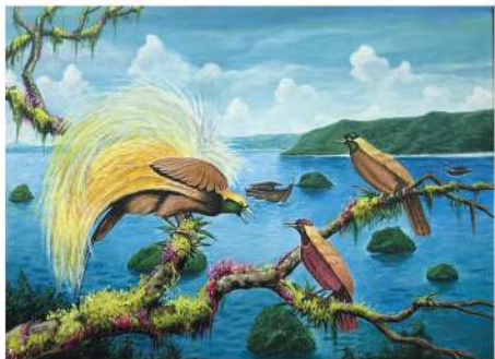
CENDRAWASIH BIRD, RAJA AMPAT PAPUA