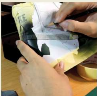
STEP 4: SKETCHING