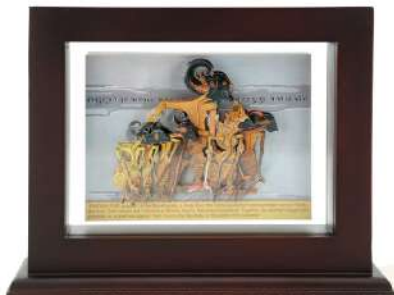
F11 : 210 x 160 x 55 mm