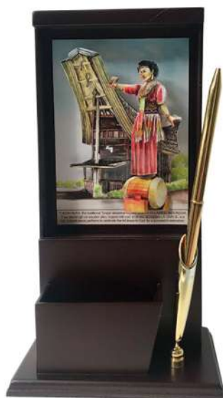
S7 : 235 x 130 x 80 mm